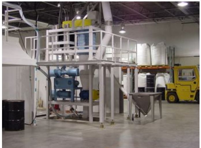
PulseWave's Unique Natural Resonance Disintegration Technology. Validated by the U.S. Department of Energy and the U.S.D.A.

PulseWave has a unique and proprietary technology that allows harvested hemp to be processed for two purposes; 1. To liberate the valuable CBD oil from the hemp for a variety of CBD based products, and; 2. Once the oil is liberated from the hemp, the remaining biomass material can be processed into a myriad of highly salable products. We know of no other technology that has the capability of processing the hemp material into such a wide variety of usable products.