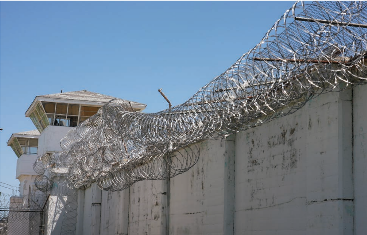
OKLAHOMA STATE PENITENTIARY - MCALESTER