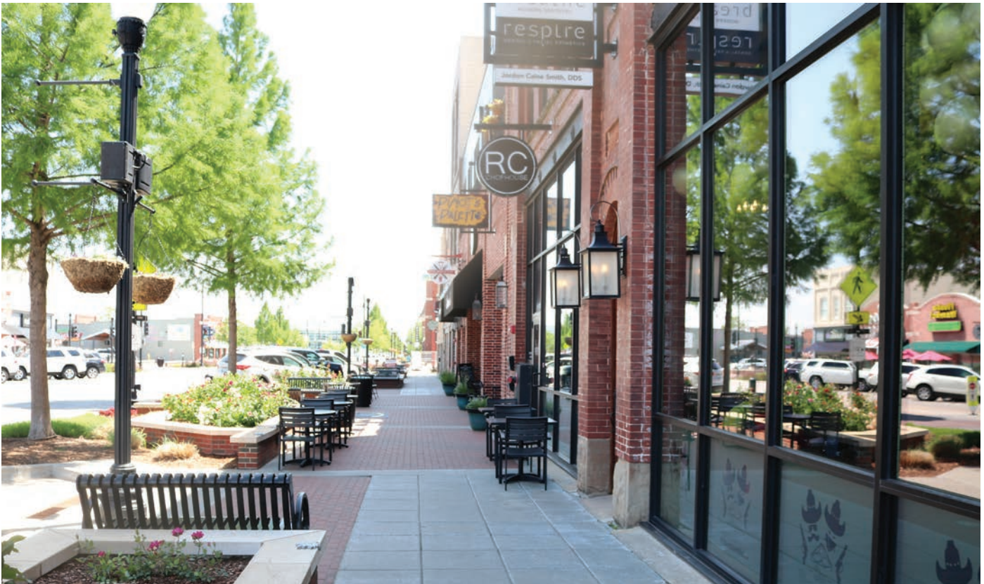
MAIN STREET AREA SHOPS - CLAREMORE