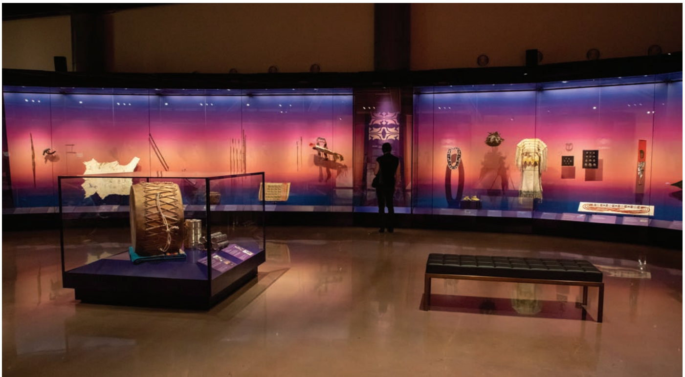
CHEROKEE NATION CULTURAL VILLAGE DILIGWA - PARK HILL