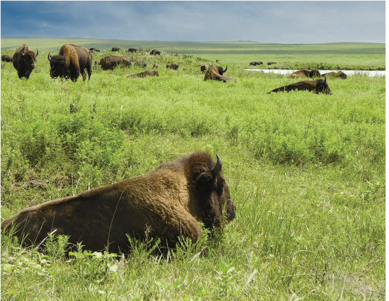
WASHITA BATTLEFIELD NATIONAL HISTORIC SITE - CHEYENNE