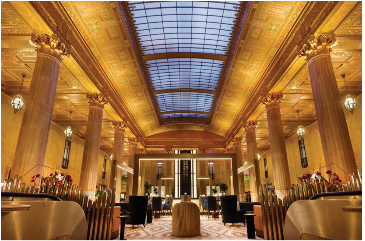
THE SKIRVIN HOTEL - OKLAHOMA CITY