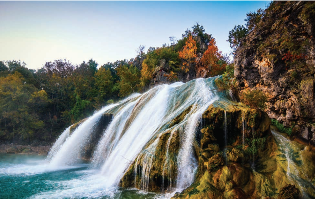
NATURAL FALLS STATE PARK - COLCORD