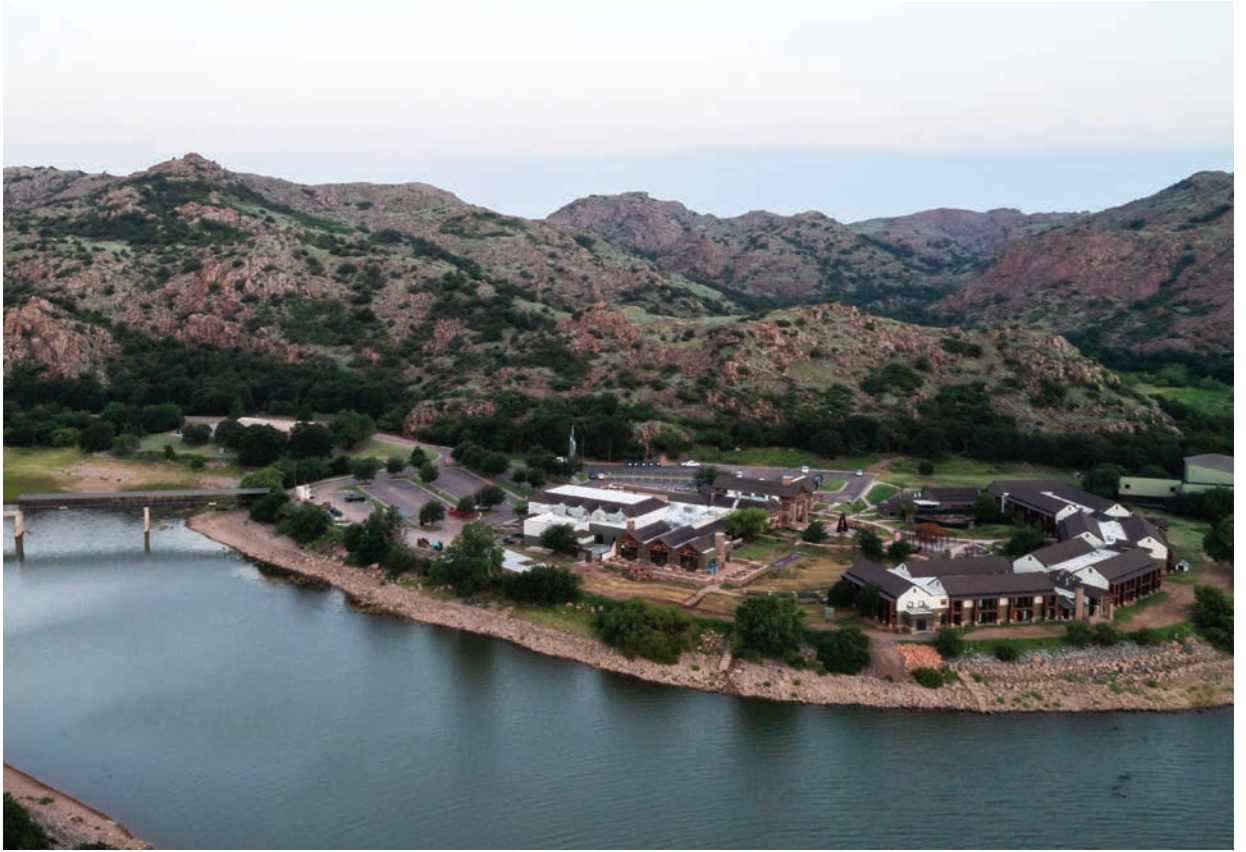
LAKE TEXOMA STATE PARK - KINGSTON