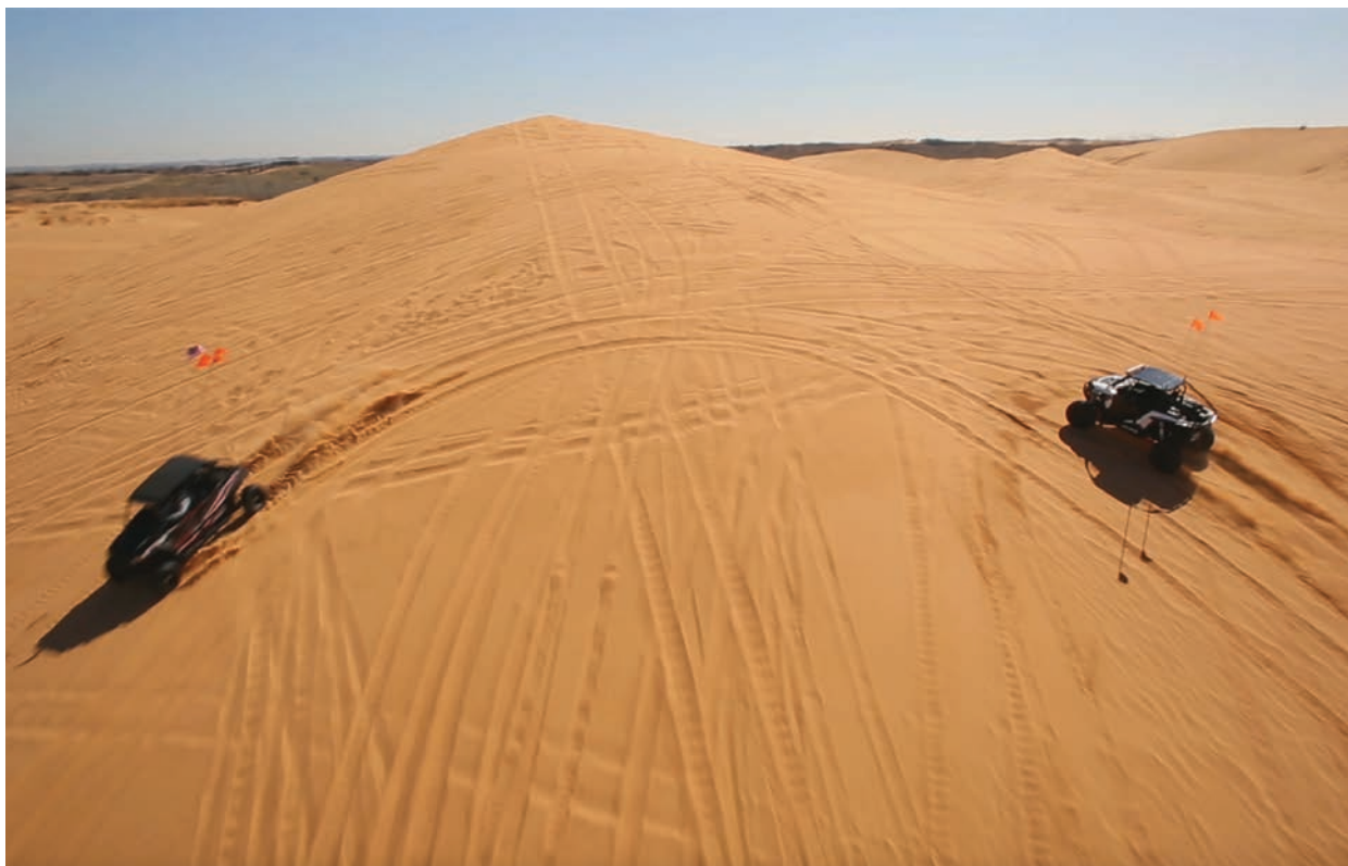
SALT PLAINS STATE PARK - JET