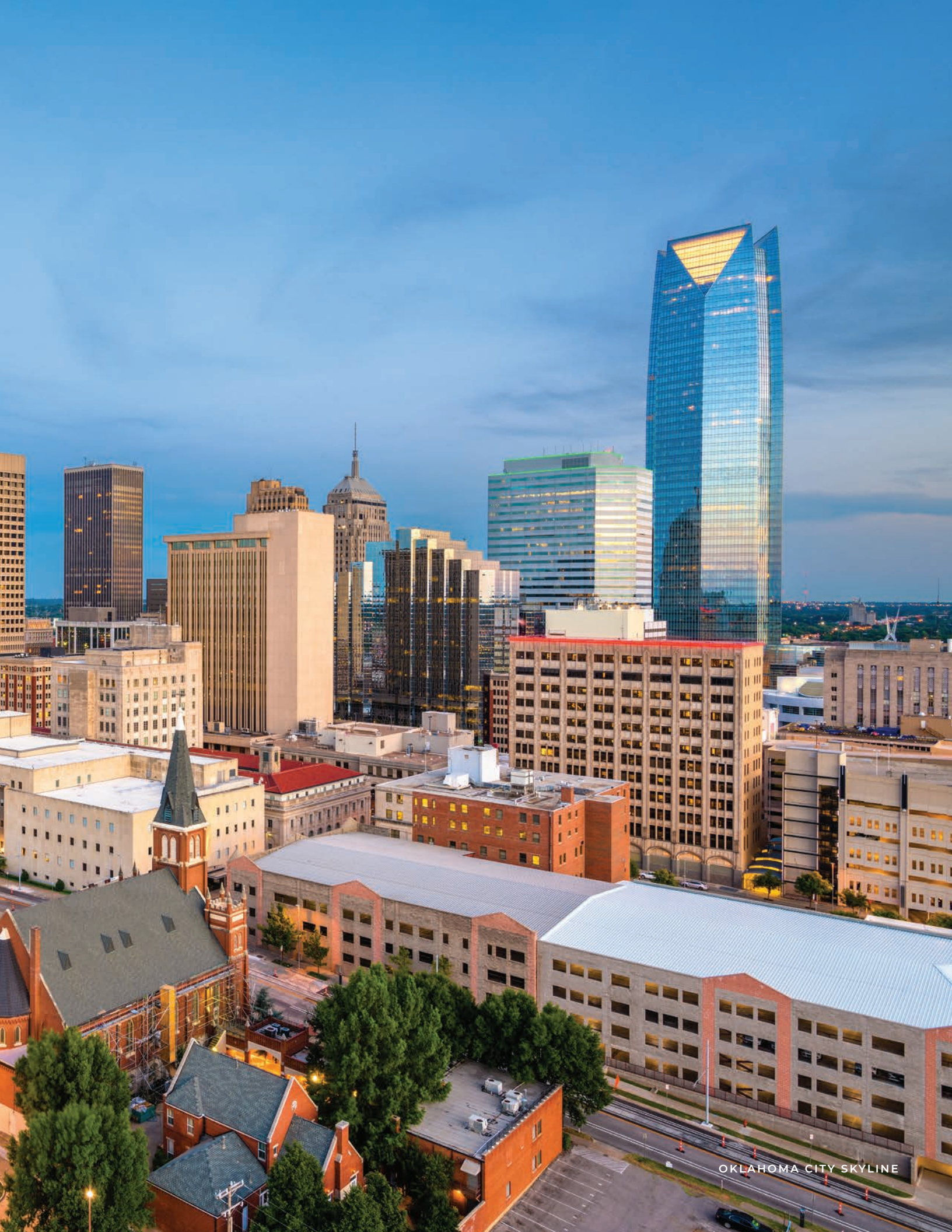
OKLAHOMA CITY SKYLINE