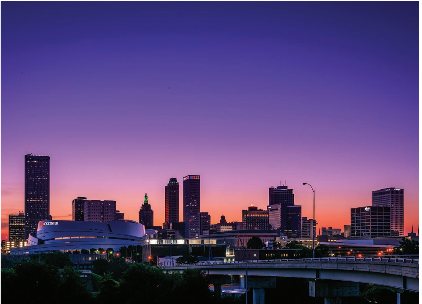
ATLAS LIFE BUILDING - TULSA