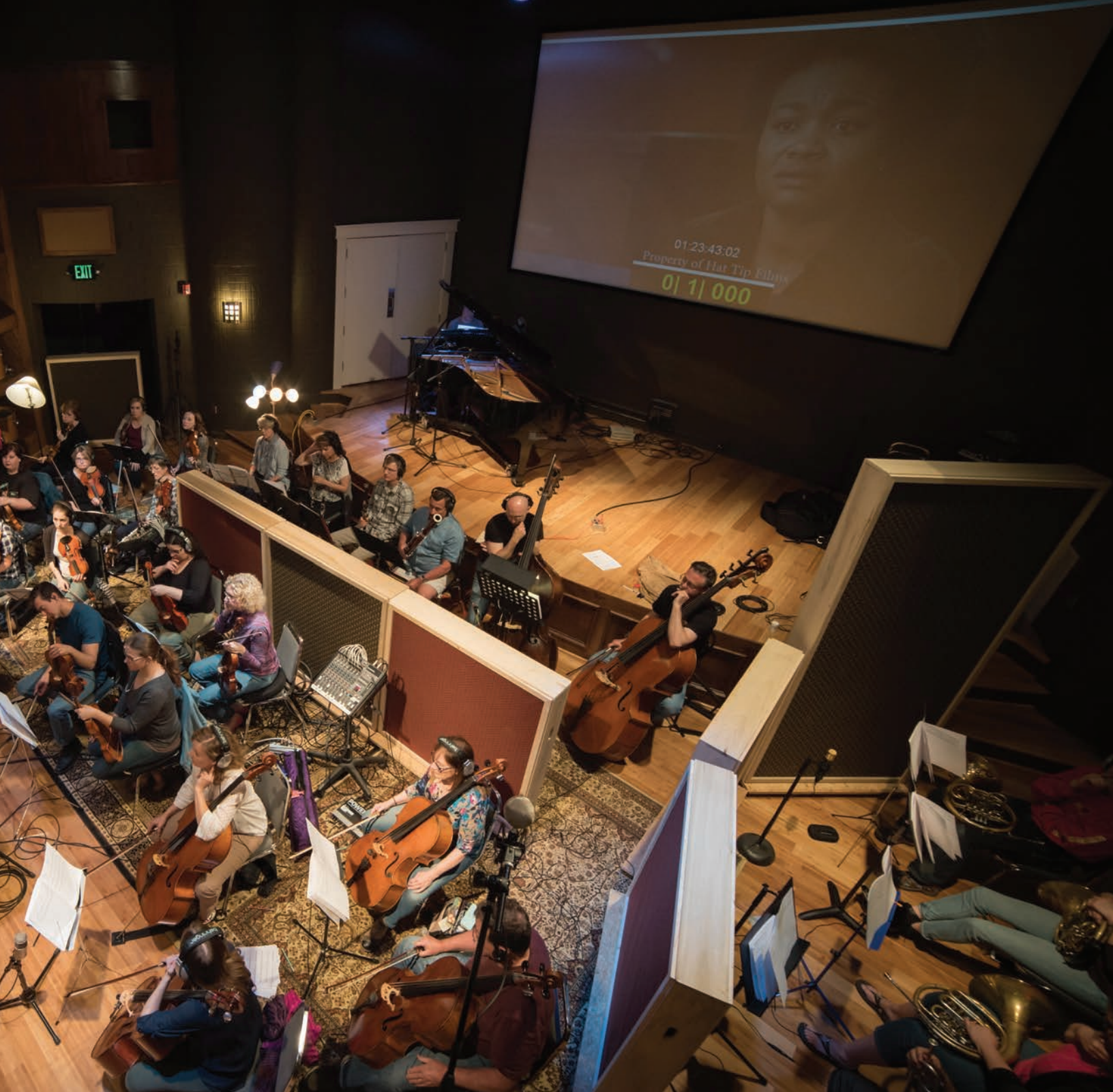
SCORE RECORDING AT CASTLE ROW STUDIOS - DEL CITY