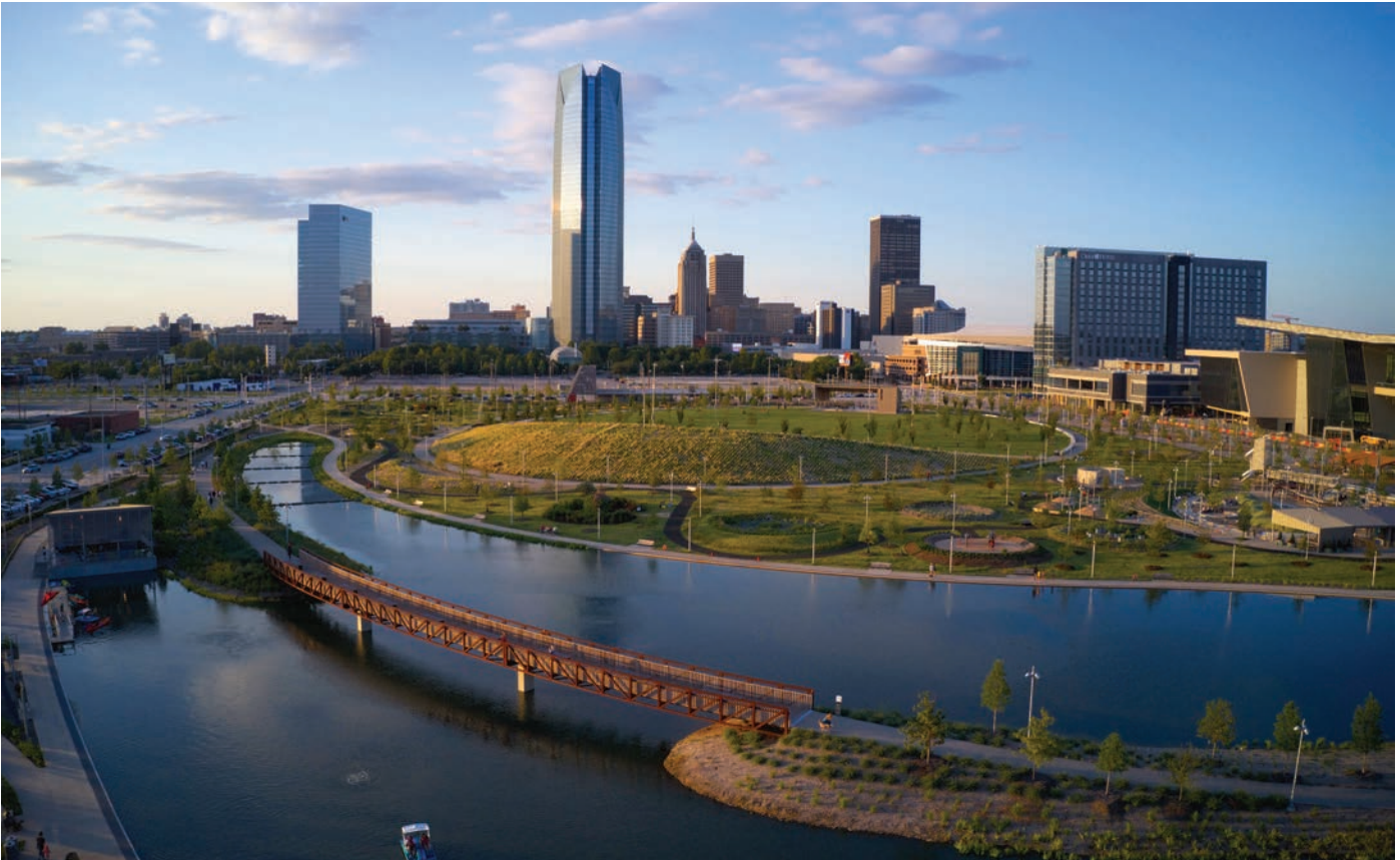
SKYDANCE BRIDGE - OKLAHOMA CITY