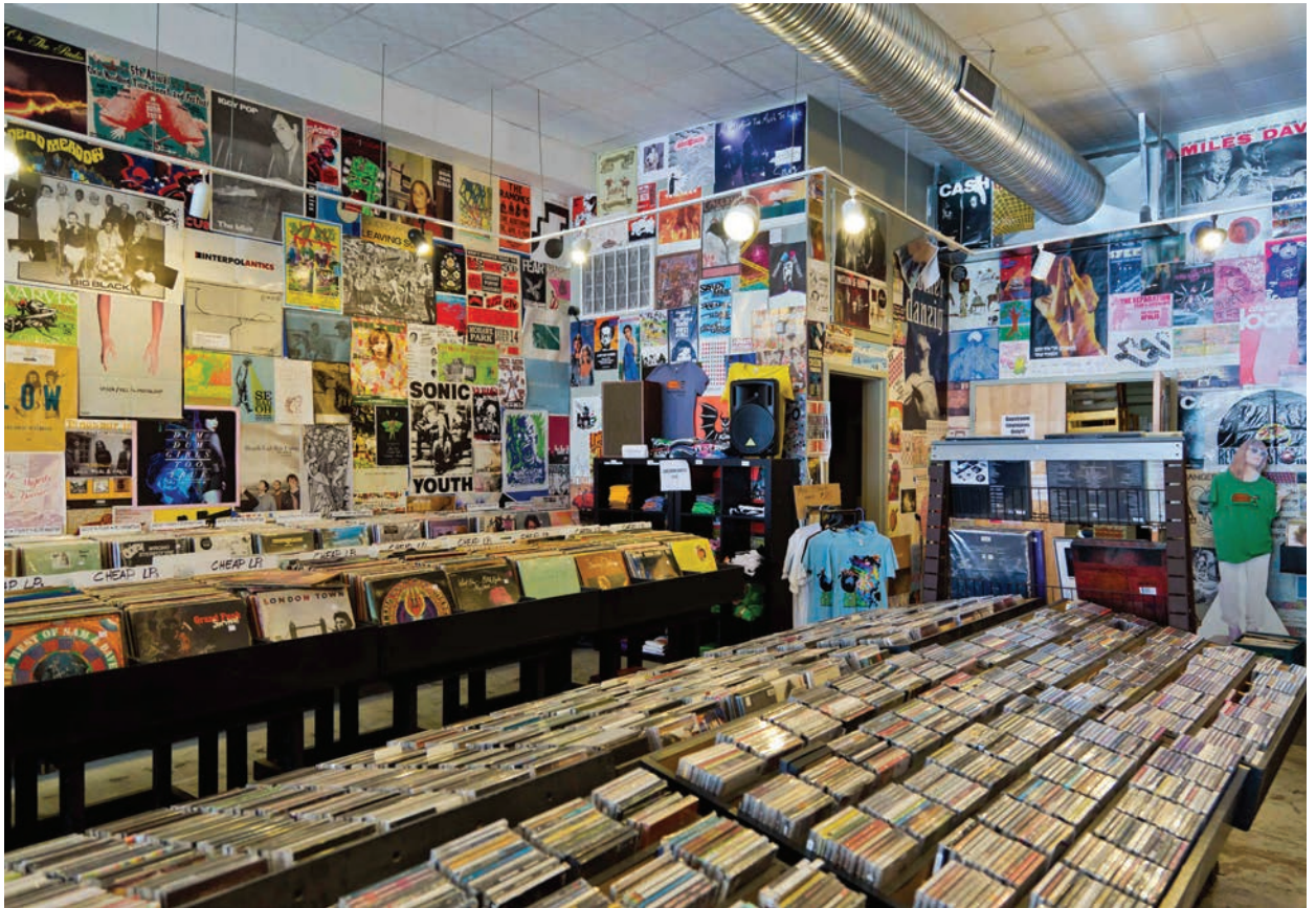
TOWER THEATRE - OKLAHOMA CITY