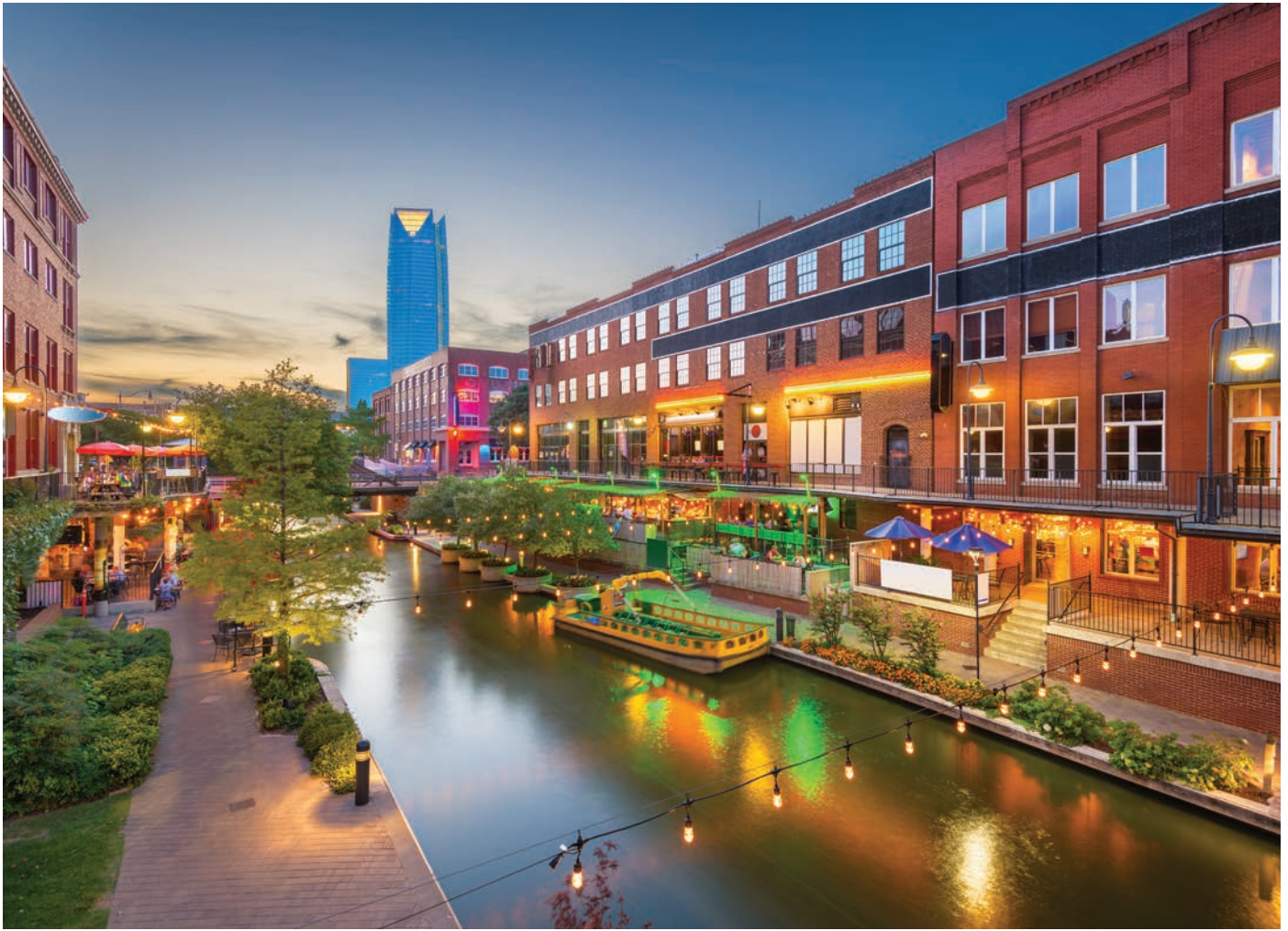
OKLAHOMA CITY STREETCAR - OKLAHOMA CITY